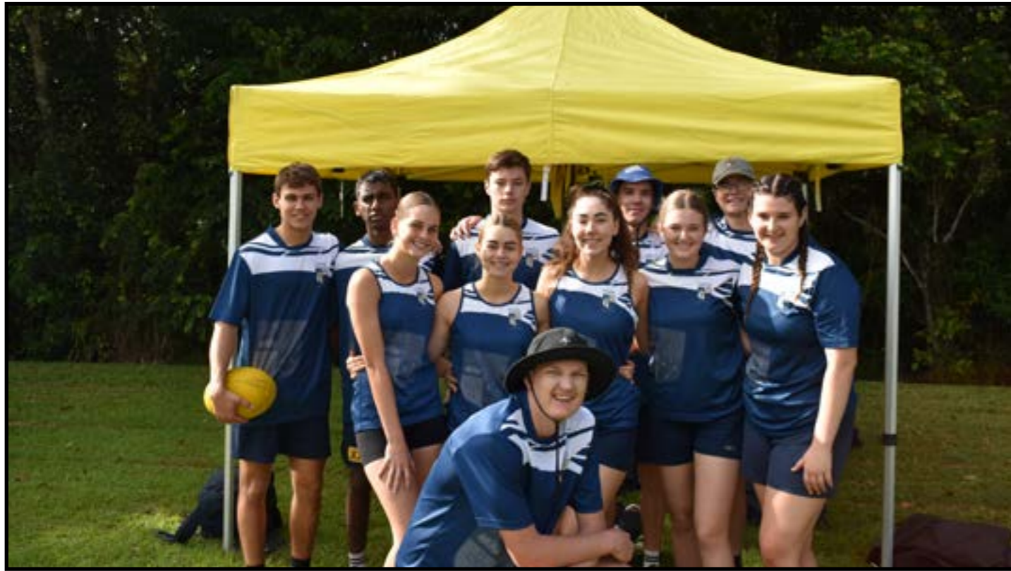
Congratulations to the winning team from St Stephen's Catholic College that competed at the Interschool NAIDOC Challenge Touch Football Event held at Kuranda District State College