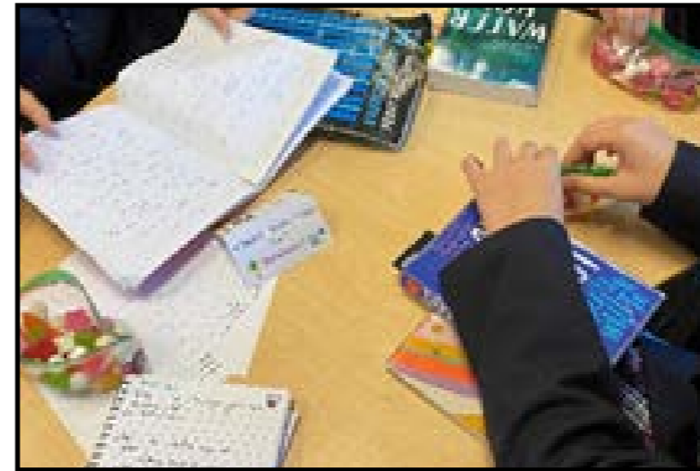
Above: How it started! Below: How it finished!

Congratulations to our dedicated reading team.