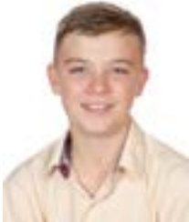
Jett Apps Tablelands 13-15 years Boys Touch Football Team