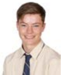
Will Simms Tablelands 16-18 years Boys Touch Football Team