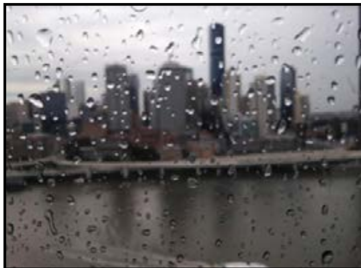
Above: Alyssa Crane