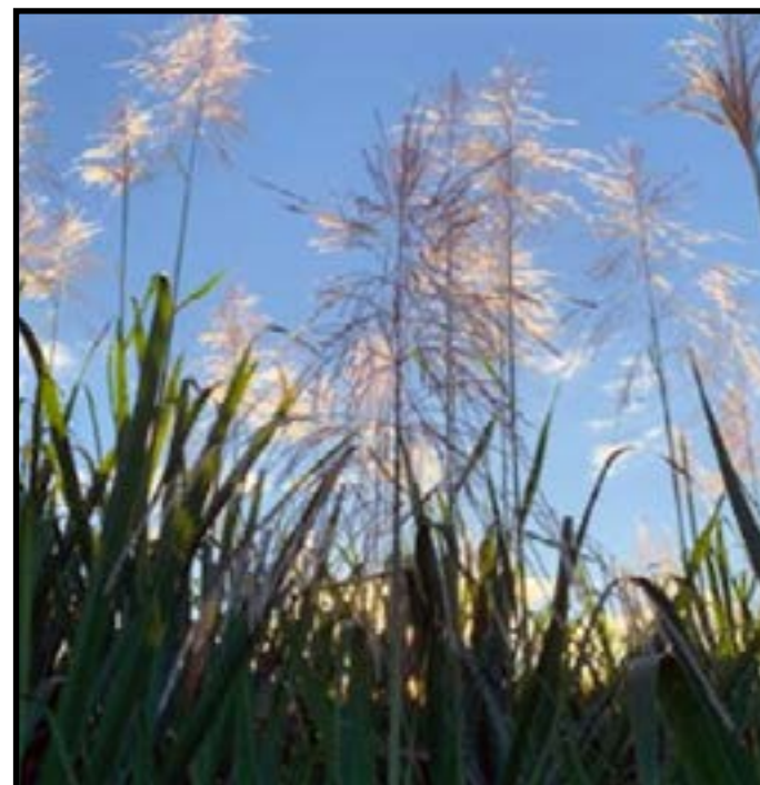
Above: Piper Ottone