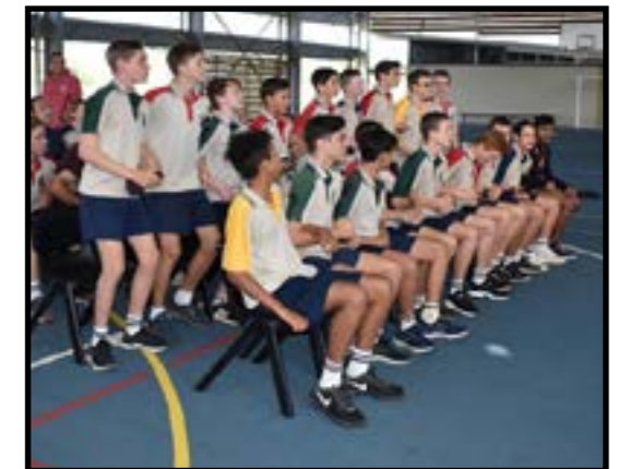
Year nine students participating in the National Evangelisation sessions.