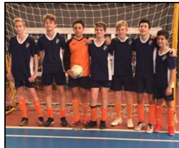
Top left: Boys under 16 team. Top right: Girls under 18 team. Middle left: Girls under 16 and 18 teams. Below right: Boys under 13 team. Below left: Boys under 14 team.

Students from St Stephen's Catholic College recently competed at the FNQ School Futsal Titles at the Redlynch Central Sports Stadium. Congratulations to the girls under 18 team for winning their age group. The boys under 16 team and boys under 13 teams were runners up in their age groups.