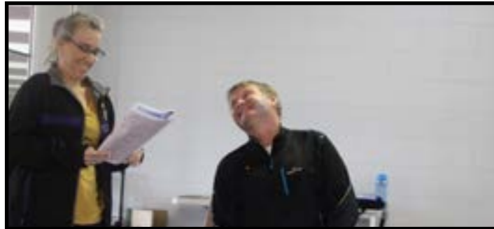
Mr Bassano, AKA Punchinello, discovering how special he truly is.