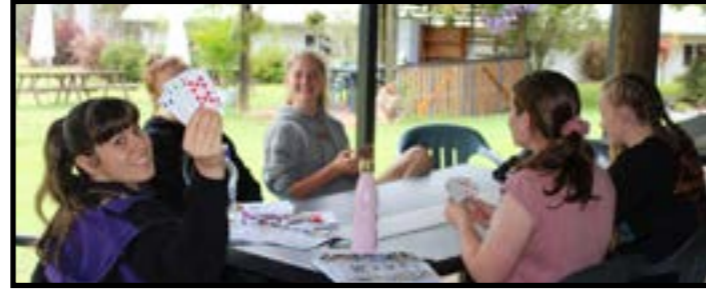
Learning some new card games.

As we hit the ground running in term two, students are reminded to stay focused during what is certainly shaping up to be a fast, action-packed senior year. Planning is well underway for the senior formal in term four, and graduation will be here before they know it. We have the upcoming athletics carnival next week which is another "last" opportunity for our seniors to become involved and forge some wonderful memories.