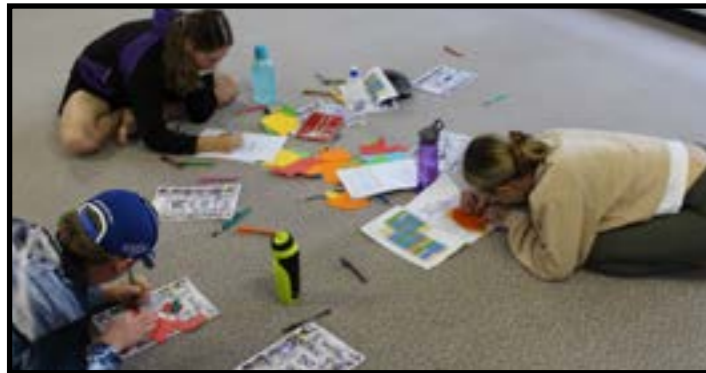
Time out to reflect and tell each other how special they are.