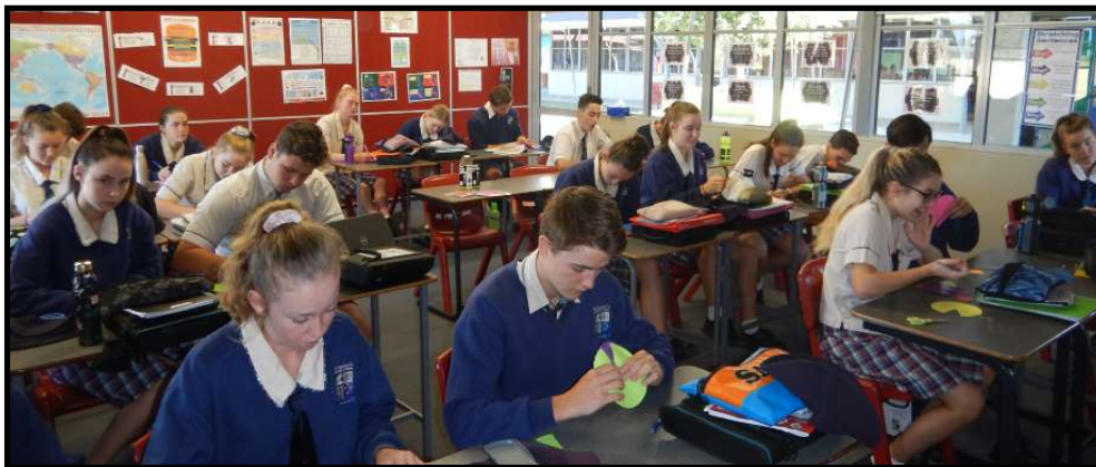
Left: year ten Humanities class.