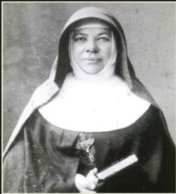
Saint Mary of the Cross (Mary Helen MacKillop) Foundress of the Sisters of St. Joseph of the Sacred Heart 1842 - 1909 Australia's First Saint! Memorial - 8 August