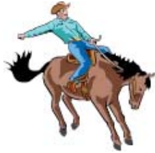
Jackaroo Motel Mareeba