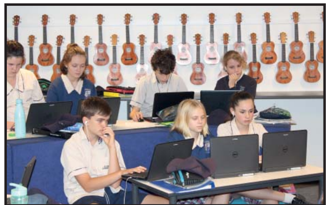
Year eight students during music lessons.