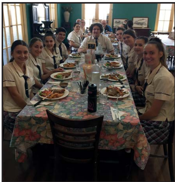
Students enjoying lunch.