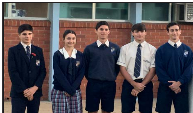
Above: Students at the Dimbulah Service.