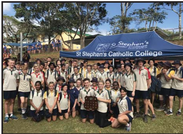
St Stephen's with the trophy for the fifth year in a row!