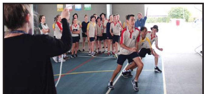
Year nine students enjoying their time at the National Evangelisation Retreat Day