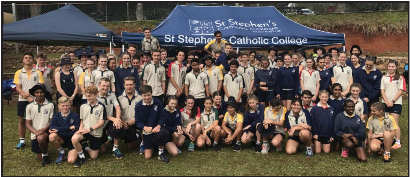
St Stephen's Catholic College Team - District Athletics Carnival - Malanda State High