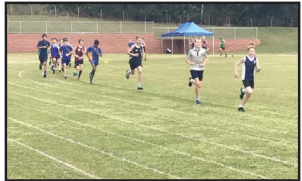
800m: End of the first lap, first, second and third.