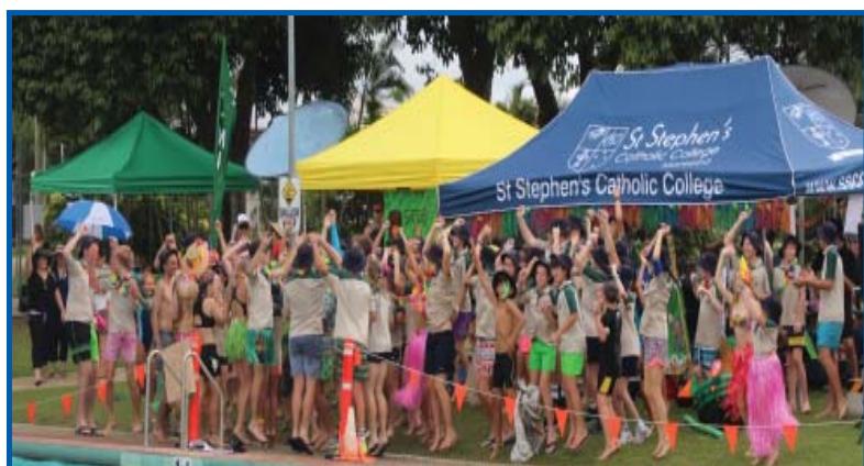
Students celebrating their win.

For the second successive year, Muluridji Pastoral House won the Inter-House Swimming Carnival. Strong student participation contributed to the carnivals success.