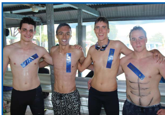
The winning Open Boys Relay Team.