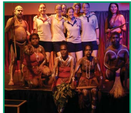
Performing at Tjapukai.