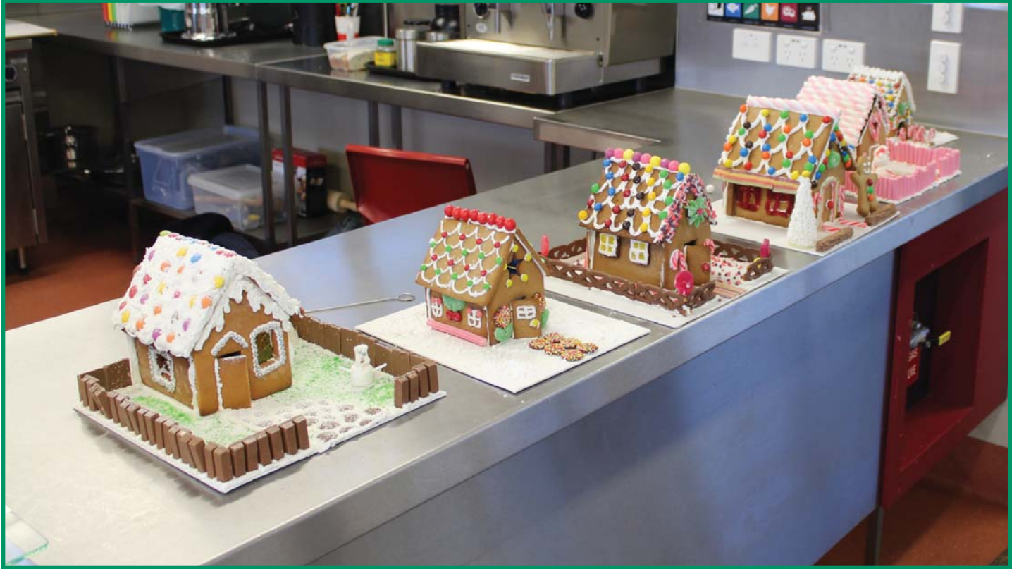
The next round of finished gingerbread houses