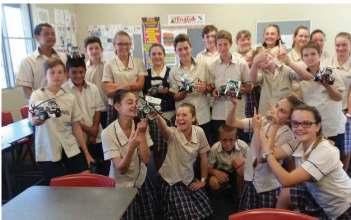
Year 8 Robotics Class