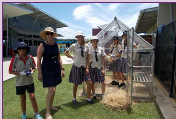
The Science Club.