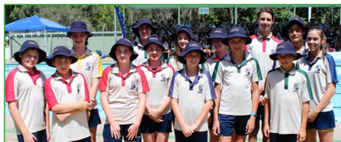
Age Champions 2016.