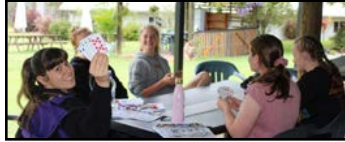
Learning some new card games.

As we hit the ground running in term two, students are reminded to stay focused during what is certainly shaping up to be a fast, action-packed senior year. Planning is well underway for the senior formal in term four, and graduation will be here before they know it. We have the upcoming athletics carnival next week which is another "last" opportunity for our seniors to become involved and forge some wonderful memories.