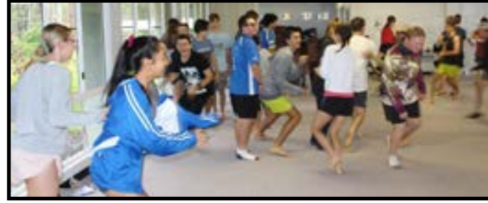
One of the many games getting students moving!