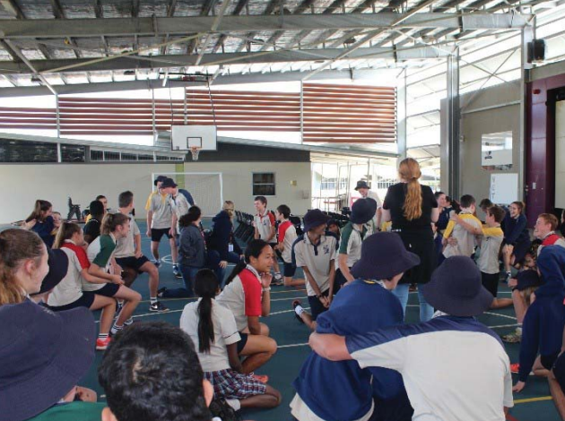
Years 8 and 9 with the NET Team