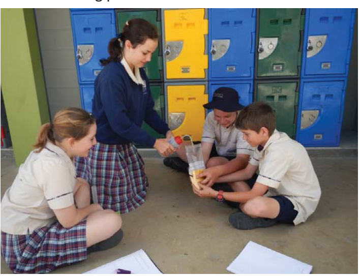
Students simulate using a perfortated bore to extract groundwater