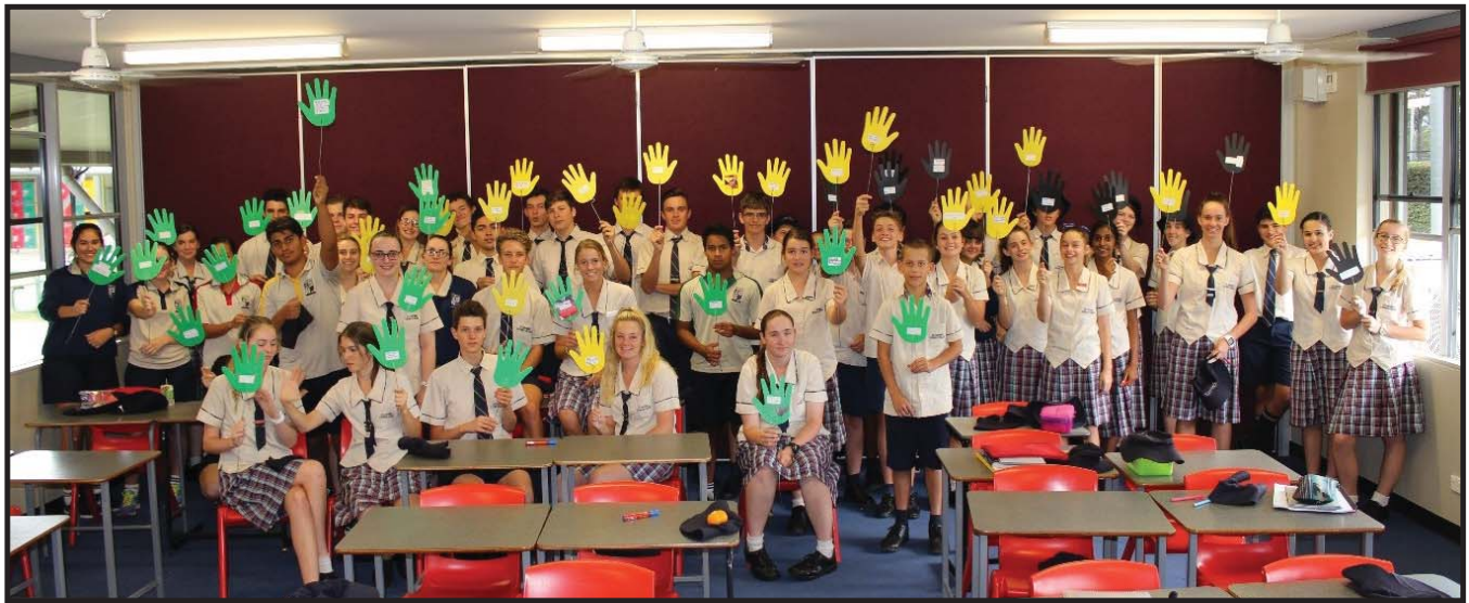
Student leaders with their hands as part of National Reconciliation Week