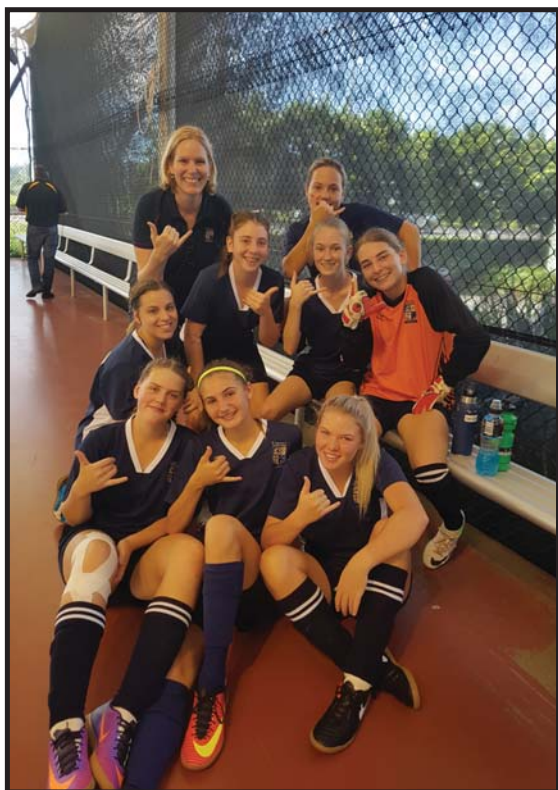
Girls Open Futsal Team