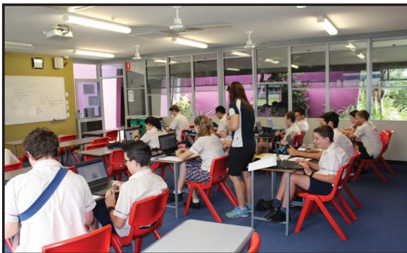
Year nine students designing their C02 dragsters