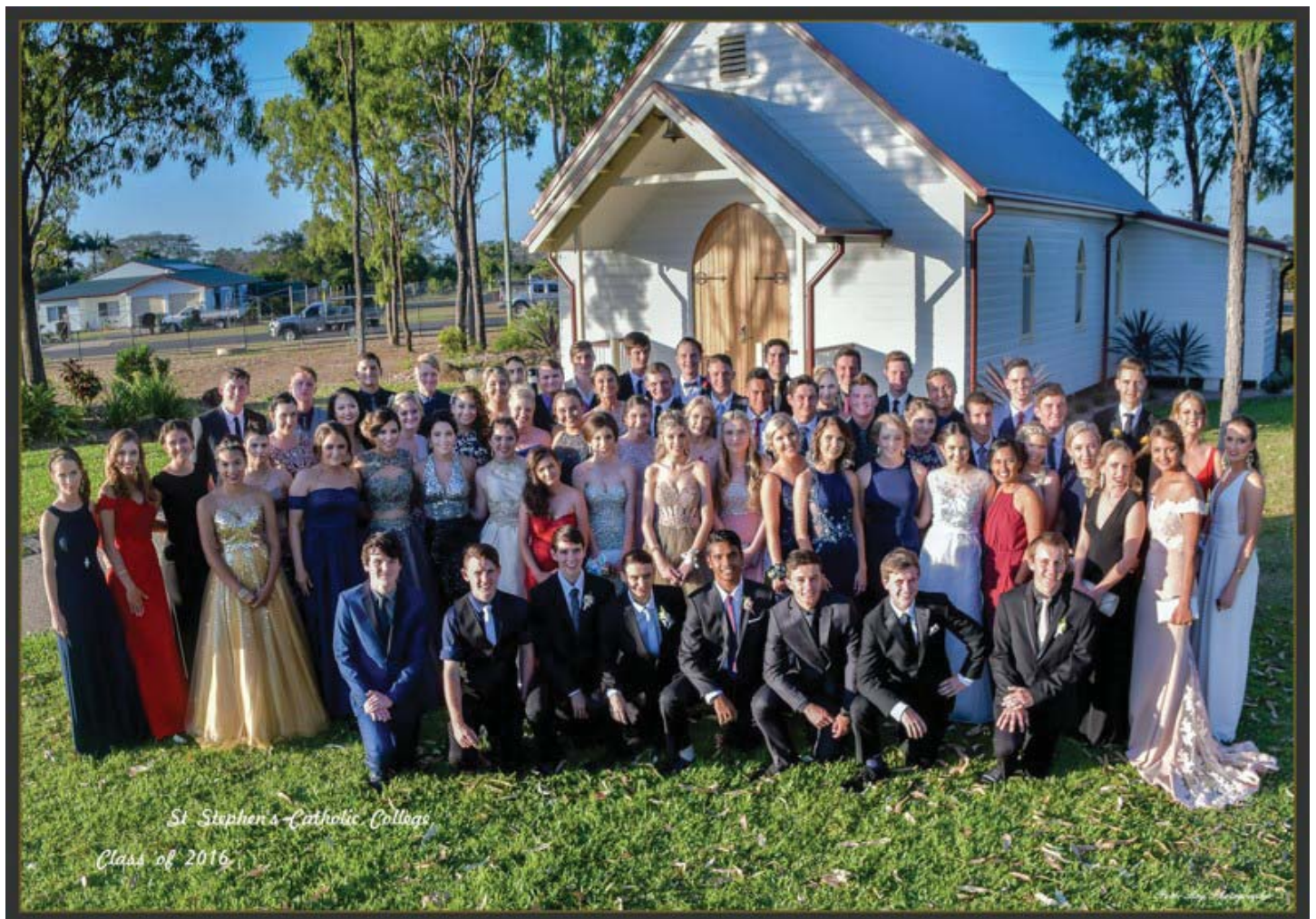
Year 12 Formal - 2016

Lot 3, McIver Road, Mareeba PO Box 624 Mareeba Qld 4880 Office Hours: 7.45 am - 3.45 pm Monday - Friday ABN: 42 498 340 094