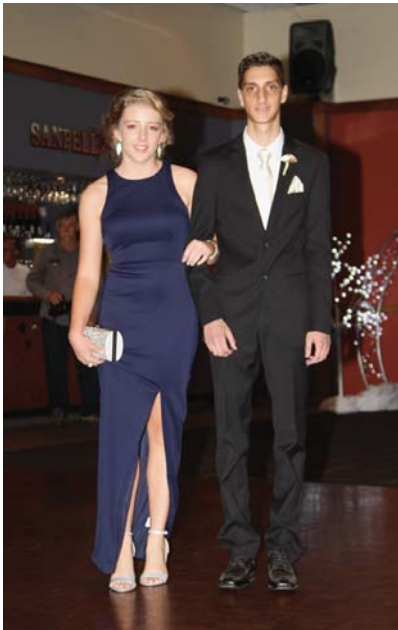
Year 12 Formal