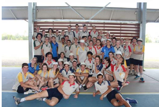
Year 12 students enjoying their last St Stephen's Day