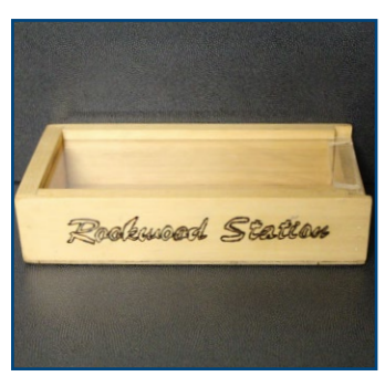
Jack Ferguson's pencil case.

Lot 3, McIver Road, Mareeba PO Box 624 Mareeba Qld 4880 Office Hours: 7.45am - 3.45pm Monday - Friday ABN: 42 498 340 094