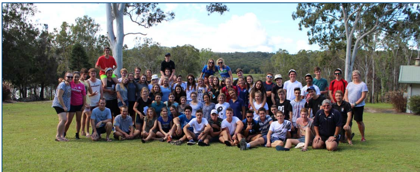
Year 12 on retreat.