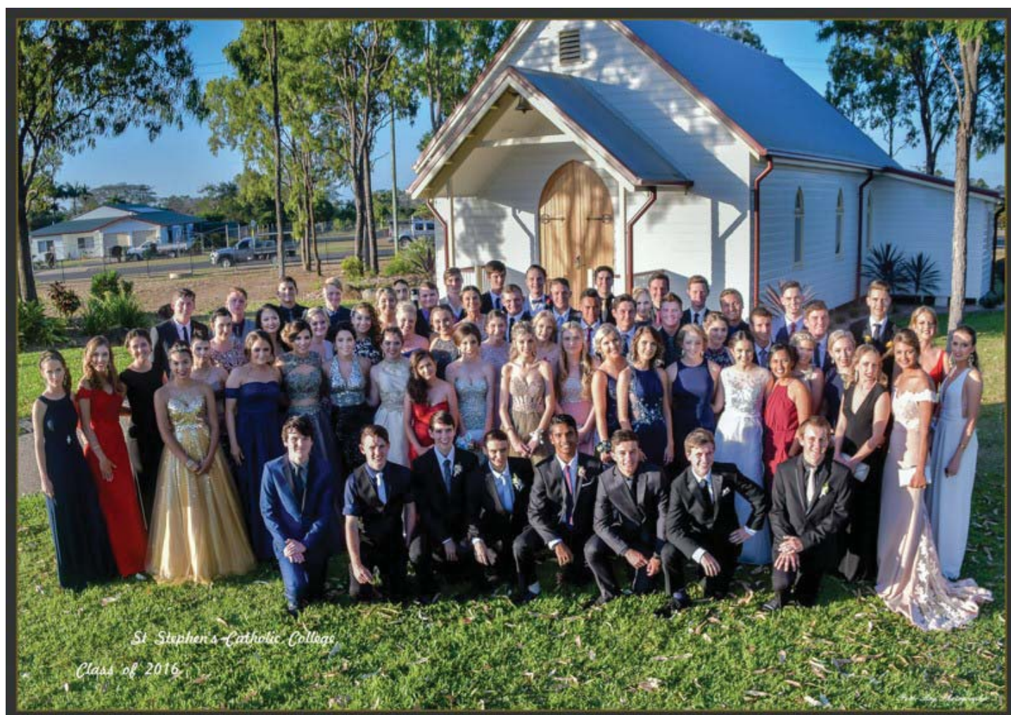
Year 12 Formal - 2016

Lot 3, McIver Road, Mareeba PO Box 624 Mareeba Qld 4880 Office Hours: 7.45 am - 3.45 pm Monday - Friday ABN: 42 498 340 094