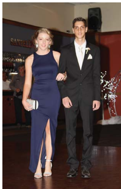
Year 12 Formal