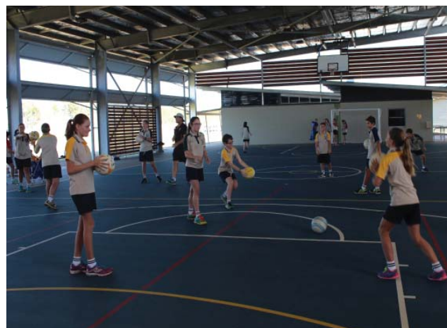
Year 7 students participating in their allocated recreation programme for term 3.