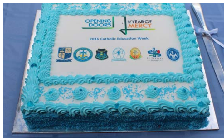
The celebration cake featured the crests of the schools that attended the mass.