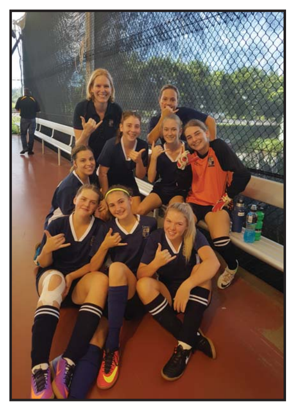
Girls Open Futsal Team